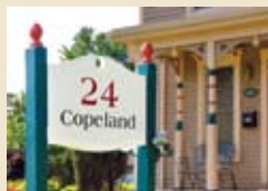
BUSINESS OFFICES Homer, NY

Providing services in a professional and caring manner.